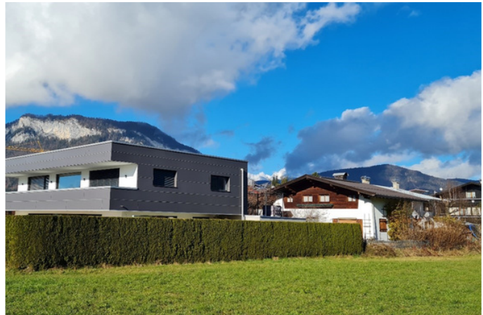
“Der Traum vom Haus im Grünen” - The dream of a single-family house in nature - great for some, unreachable for many, unsustainable for us all (picture taken in St. Johann).

structures, the project has three core aims: (1) to explore innovative ways to combine radical with pragmatic actions to achieve climate-friendly and climate-resilient practices and policies; (2) to define transformative climate actions in the field of settlement structures; and (3) to co-design transformative climate actions in and with two Austrian rural micro-regions – St. Johann in Tyrol and Pöllau (Hartberg) in Styria. The project is based on a common understanding that reduction of land use and unsustainable transport patterns are necessary conditions for climate-friendly settlement structures.