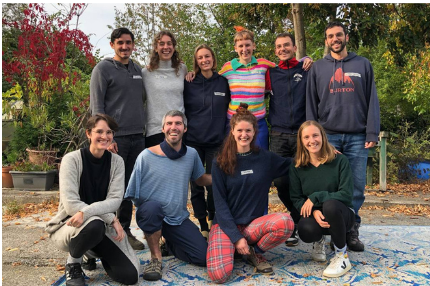
Some of Degrowth Vienna active members at our seminar weekend in October 2022.

It is the last time we report about the first and second, as we are phasing out of them to work on a new collective strategy for 2023 that will bring the team together and avoid having too many sub-groups. The remaining of this section further expands on activities we carried out in 2022.