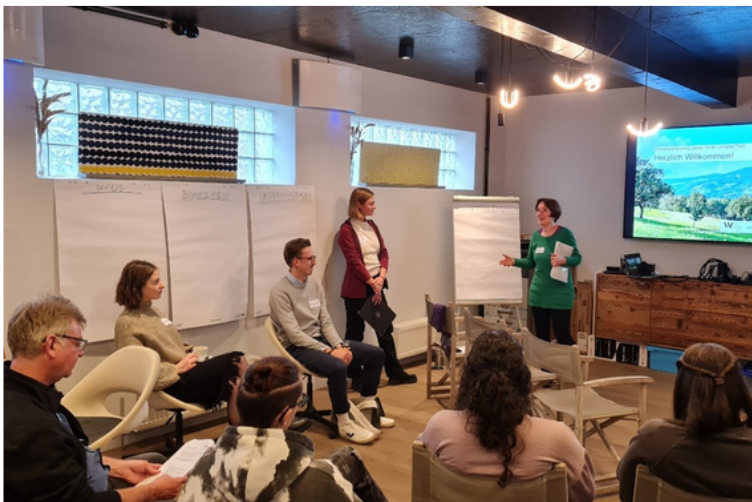
Workshop in November in St. Johann.

The project started in early 2022 and will last throughout 2023 thanks to funding from the Austrian Climate Research Program. Its attempt to combine radicality with pragmatic actions is reflected in the consortium which resembles three different institutional logics: research, with the WU Institute of Multilevel Governance and Development (lead organisation); policy with the Environment Agency Austria (Umweltbundesamt); and activism and civil society with Degrowth Vienna.